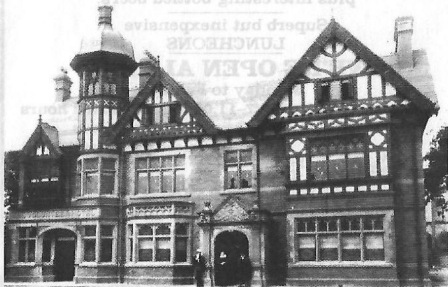
The Volunteer - just about the right size for a Holts pub

The Woodthorpe at Heaton Park is open again after undergoing an extensive refit.