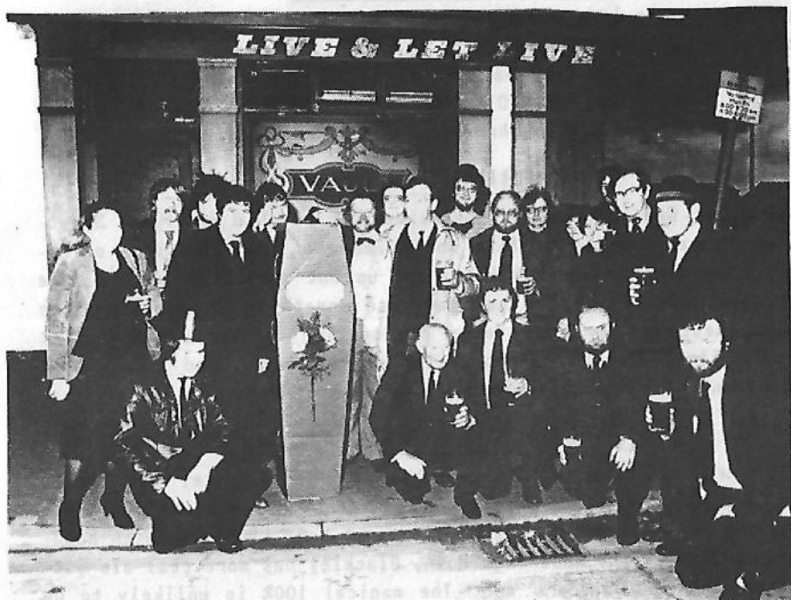
A sombre occasion caught by the camera outside the Live and Let Live during the Regent Road Wake of April 7.